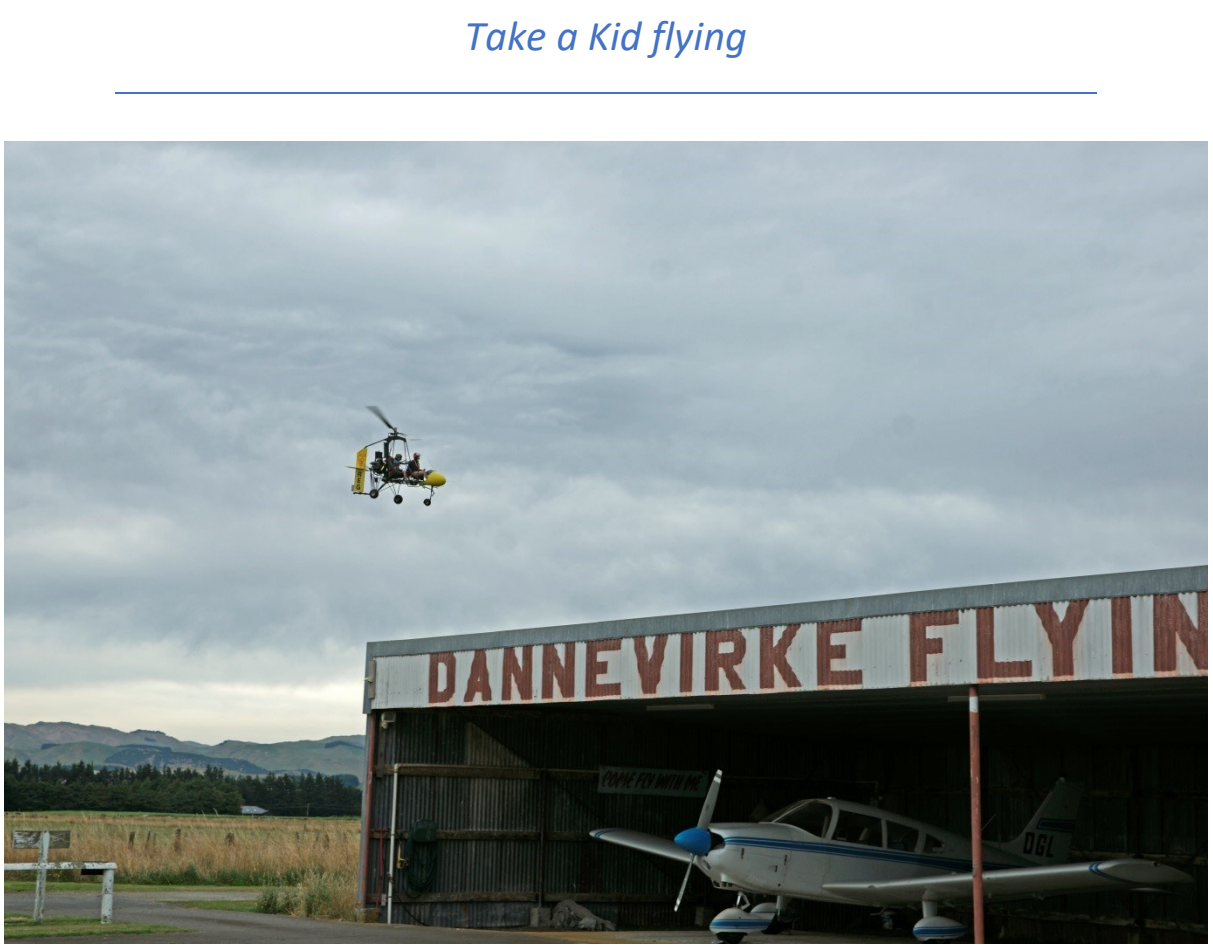
REG on approach to Runway 26 at the Dannevirke Flyin – just like the sign says.

B ack in November, as has been the case for 24 years now, I started to make a plan for the Dannevirke Fly-in. I didn't go last year due terrible weather and the 2022 event was cancelled due difficulties with Council and Covid. I couldn't miss catching up with friends for three years in a row, so arrangements needed to be made.